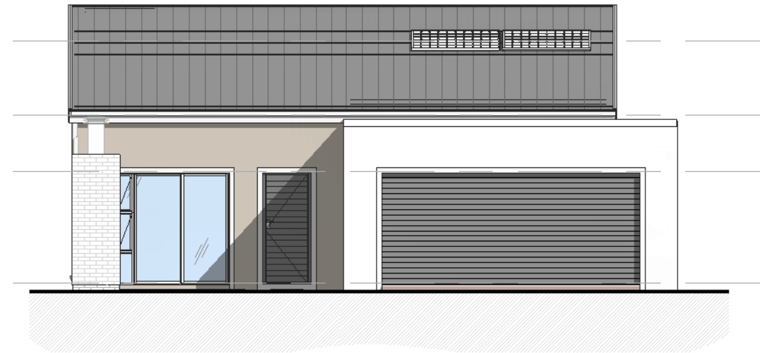
TYPICAL UNIT TYPE A - FRONT ELEVATION