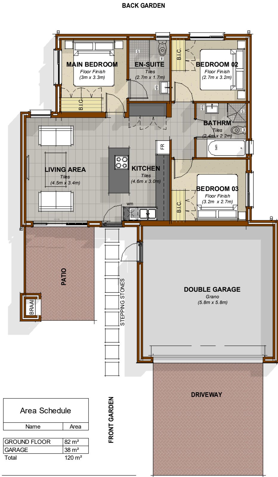
TYPICAL UNIT TYPE A - GROUND FLOOR PLAN